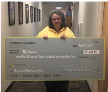
Donation to Haven

The number of individuals who demonstrated increased nutrition skills