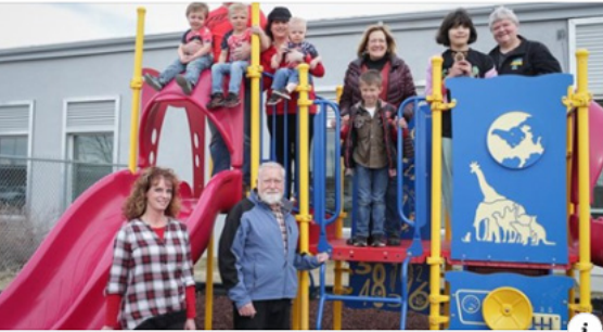
EICAP program offers support to grandparent-grandchild homes