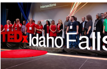
TEDx Idaho Falls – former Haven client was invited to give a TEDx talk. 2019