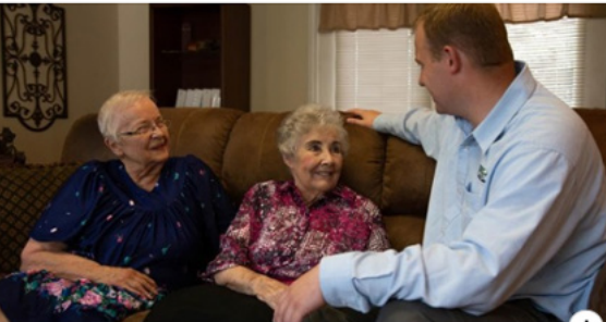
Local classes show caregivers how to care for their family and themselves