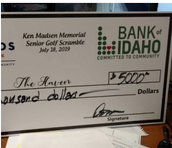
Donation to Haven

Her kids' behavior calmed down and they no longer live in fear. We also connected her to the Domestic Violence Center for counseling. She has learned how to budget and get her finances in order. She had tried to leave him before but always went back because she had no help. She said if she had just been given a chance of help to get out of the situation she would have left and stayed away. She was given that