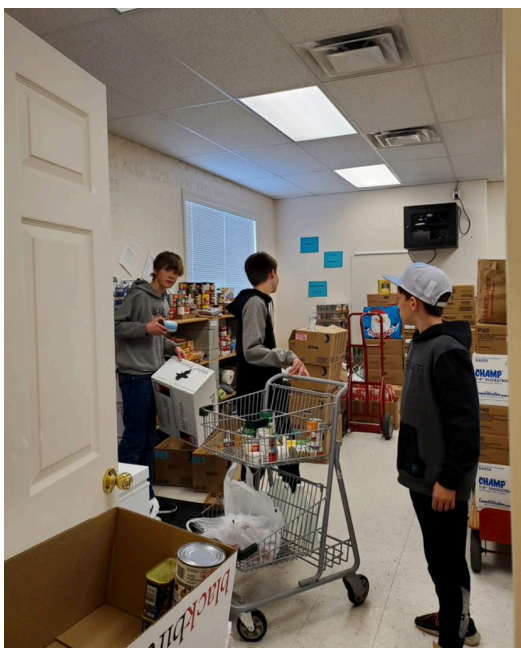
Volunteers at the Food Pantry