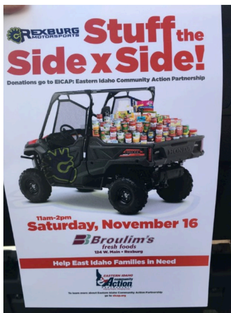
Rexburg Motorsports Food Drive (about 426 Items donated)