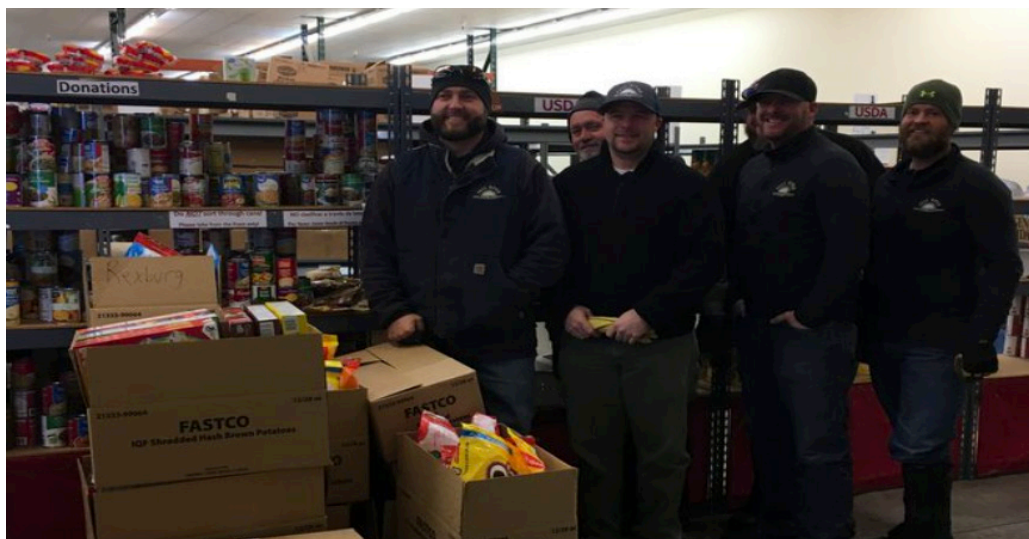
Fall River Electric Food Drive (about 300 Items donated)